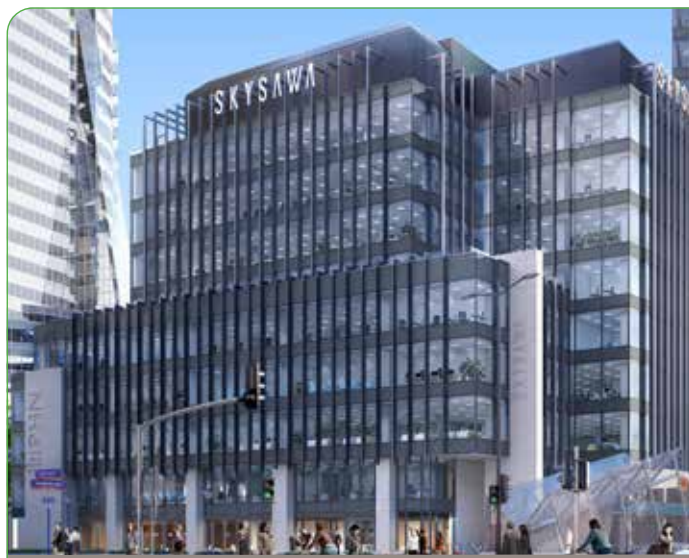
BREEAM International 2016 New Construction – Outstanding

With the launch of BREEAM In-Use v6, BREEAM became the first assessment method to explicitly integrate resilience alongside environmental performance in a sustainability standard. This brought together existing issues which used to be parts of other environmental categories, but also allowed BRE to include new areas of interest, such as social risks and opportunities and those related to the transition to a low carbon economy, aligning BREEAM with The Task Force on Climate-related Financial Disclosures (TCFD). It also firmly established resilience as a key component of the assessment of the sustainability of building assets, communities and infrastructure.